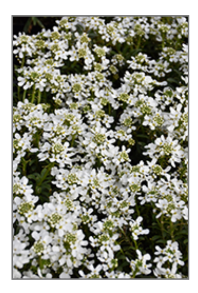
Snow Cone Candytuft flowers