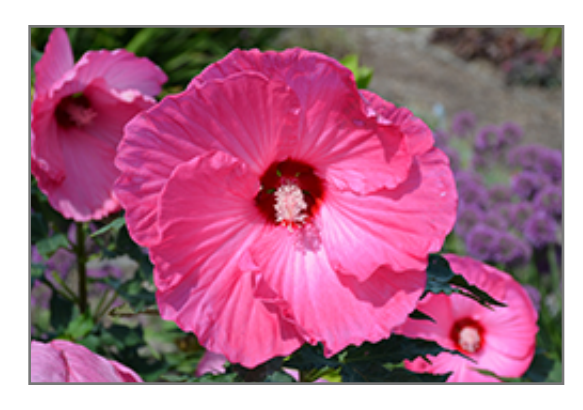
Airbrush Effect Hibiscus flowers