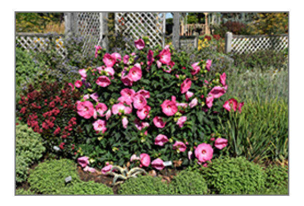
Airbrush Effect Hibiscus in bloom