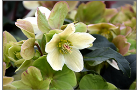
HGC Winter's Bliss Hellebore flowers

HGC Winter's Bliss Hellebore is recommended for the following landscape applications;