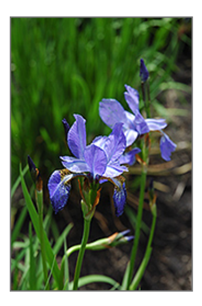
Dragonfly Siberian Iris flowers

Dragonfly Siberian Iris has masses of beautiful powder blue flag-like flowers with harvest gold throats and navy blue falls at the ends of the stems in mid spring, which emerge from distinctive navy blue flower buds, and which are most effective when planted in groupings. The flowers are excellent for cutting. Its sword-like leaves remain green in colour throughout the season.