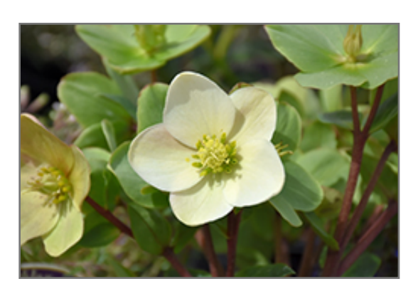
HGC Champion Hellebore flowers

This attractive variety produces bushy mounds of thick evergreen leaves; flower stalks, held above the foliage bear showy, outward facing, creamy white blooms with pink reverses; a great selection for shade gardens