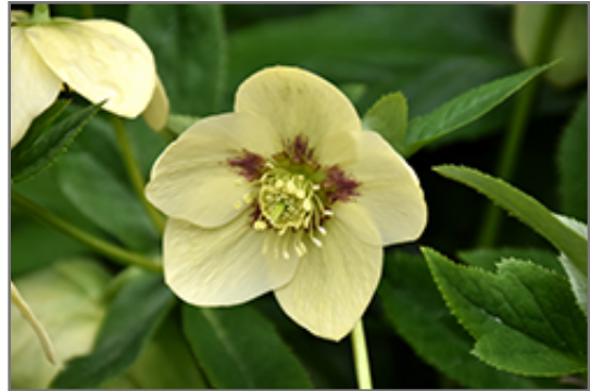
Winter Jewels Golden Sunrise Hellebore flowers

Winter Jewels Golden Sunrise Hellebore is recommended for the following landscape applications;