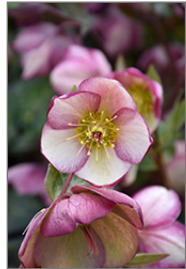
Frostkiss Glenda's Gloss Hellebore flowers

Frostkiss Glenda's Gloss Hellebore is recommended for the following landscape applications;