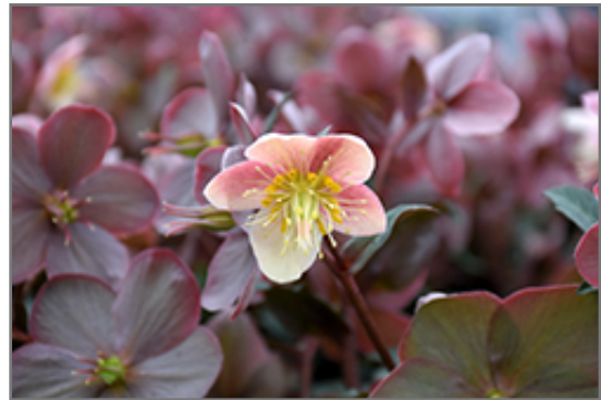
HGC Camelot Hellebore flowers

HGC Camelot Hellebore is recommended for the following landscape applications;