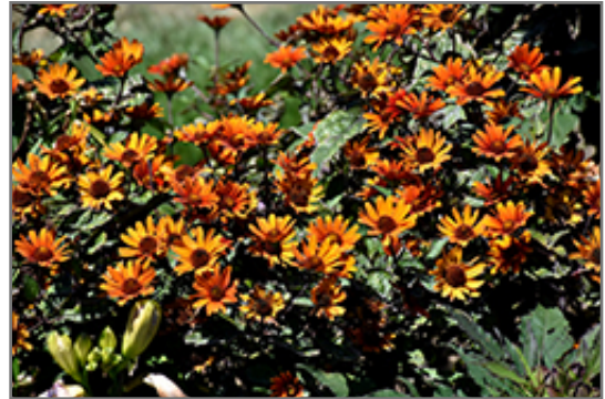
Bleeding Hearts False Sunflower flowers

This plant does best in full sun to partial shade. It is very adaptable to both dry and moist locations, and should do just fine under typical garden conditions. It is not particular as to soil type or pH, and is able to handle environmental salt. It is highly tolerant of urban pollution and will even thrive in inner city environments. This is a selection of a native North American species. It can be propagated by division; however, as a cultivated variety, be aware that it may be subject to certain restrictions or prohibitions on propagation.