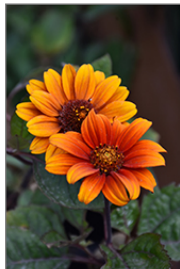
Bleeding Hearts False Sunflower flowers