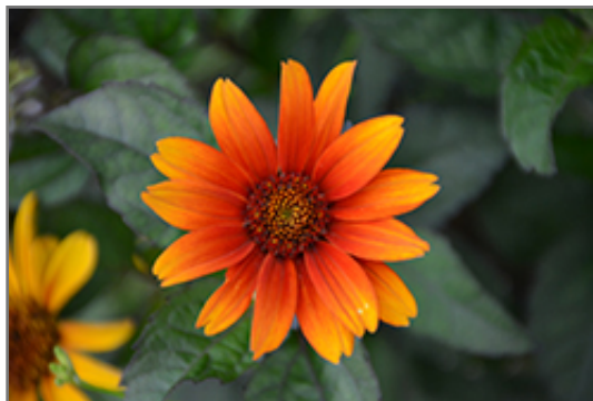
Bleeding Hearts False Sunflower flowers

Bleeding Hearts False Sunflower is an herbaceous perennial with an upright spreading habit of growth. Its medium texture blends into the garden, but can always be balanced by a couple of finer or coarser plants for an effective composition.