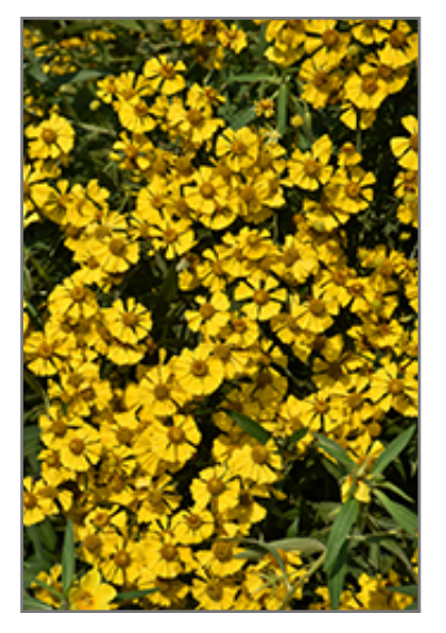
Sneezeweed flowers

A late summer and fall bloomer that brightens the garden with vibrant yellow flowers, when everything else starts to fade; adapts to most soils; regular watering needed