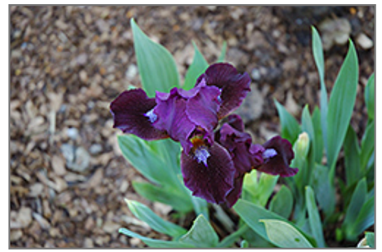
Dark Vader Iris flowers