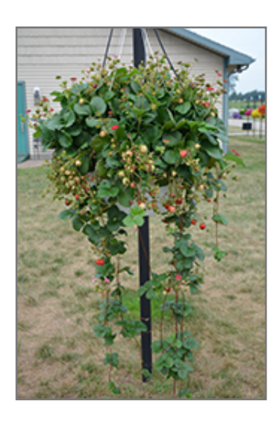
Berried Treasure Red Strawberry