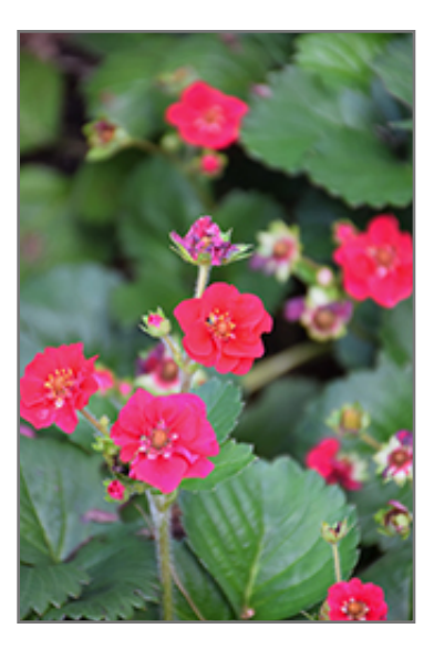
Berried Treasure Red Strawberry flowers

Berried Treasure Red Strawberry has masses of beautiful semi-double red daisy flowers with gold eyes along the stems from early to late summer, which are most effective when planted in groupings. Its round compound leaves remain green in colour throughout the season. It features an abundance of magnificent red berries from early summer to early fall.