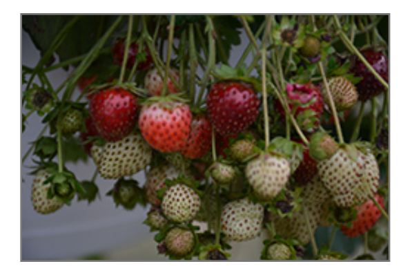
Berried Treasure Red Strawberry fruit