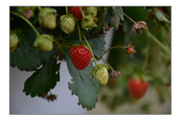
Berried Treasure Pink Strawberry fruit