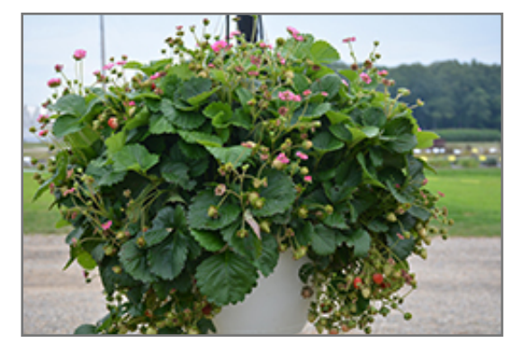
Berried Treasure Pink Strawberry

Berried Treasure Pink Strawberry is a good choice for the edible garden, but it is also well-suited for use in outdoor pots and containers. Because of its spreading habit of growth, it is ideally suited for use as a 'spiller' in the 'spiller-thriller-filler' container combination; plant it near the edges where it can spill gracefully over the pot. Note that when growing plants in outdoor containers and baskets, they may require more frequent waterings than they would in the yard or garden. Be aware that in our climate, most plants cannot be expected to survive the winter if left in containers outdoors, and this plant is no exception. Contact our experts for more information on how to protect it over the winter months.