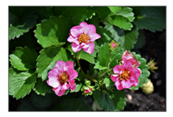
Berried Treasure Pink Strawberry flowers

Berried Treasure Pink Strawberry has masses of beautiful semi-double pink daisy flowers with gold eyes along the stems from early to late summer, which are most effective when planted in groupings. Its round compound leaves remain green in colour throughout the season. It features an abundance of magnificent red berries from early summer to early fall.