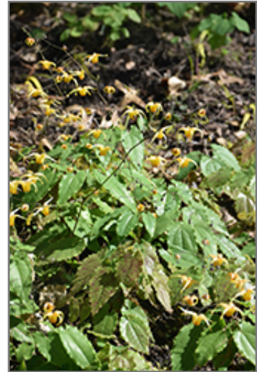
Akane Barrenwort in bloom

Akane Barrenwort is recommended for the following landscape applications;