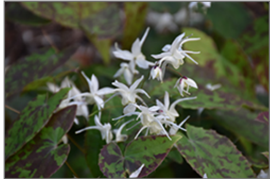
Splish Splash Barrenwort flowers

Splish Splash Barrenwort is recommended for the following landscape applications;