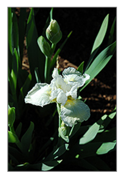
Cotton Blossom Iris flowers

Cotton Blossom Iris has masses of beautiful white flag-like flowers with yellow throats and a buttery yellow beard at the ends of the stems in mid spring, which are most effective when planted in groupings. The flowers are excellent for cutting. Its sword-like leaves remain green in colour throughout the season.