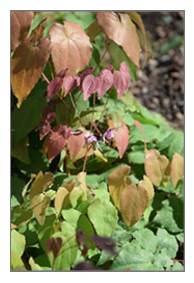
Pink Elf Barrenwort in bloom

Delicate nodding flowers, reminiscent of columbine, are pink, with deep rose centers; makes a great shade groundcover; attractive, burgundy to copper new foliage matures to light green