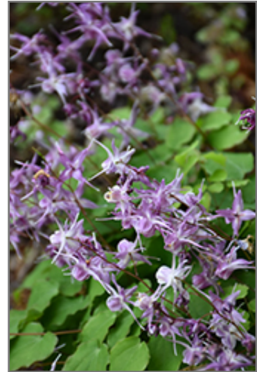
Lilac Fairy Bishop's Hat flowers