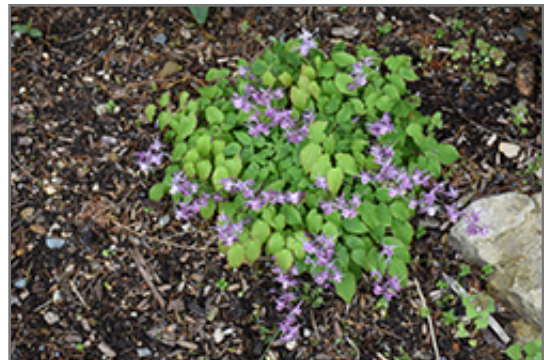
Lilac Fairy Bishop's Hat in bloom