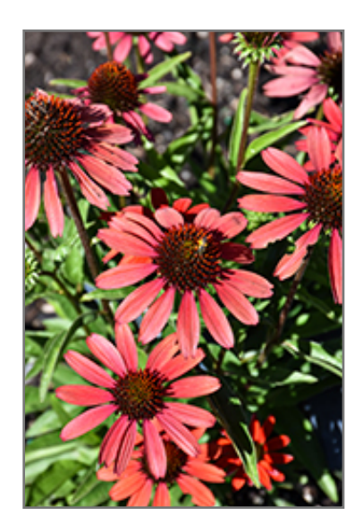
Kismet Red Coneflower flowers

This is a relatively low maintenance plant, and is best cleaned up in early spring before it resumes active growth for the season. It is a good choice for attracting butterflies and hummingbirds to your yard, but is not particularly attractive to deer who tend to leave it alone in favor of tastier treats. It has no significant negative characteristics.