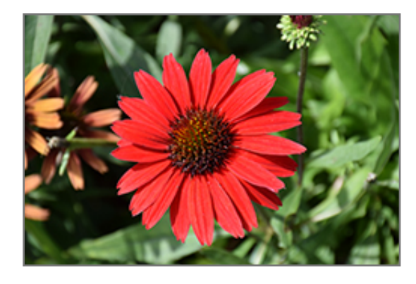
Kismet Red Coneflower flowers

Multitudes of glowing, deep red flowers with dark reddish-gold cones, produced on strong stems; blooms from early summer until frost; use in naturalized areas with other native plants; great for borders