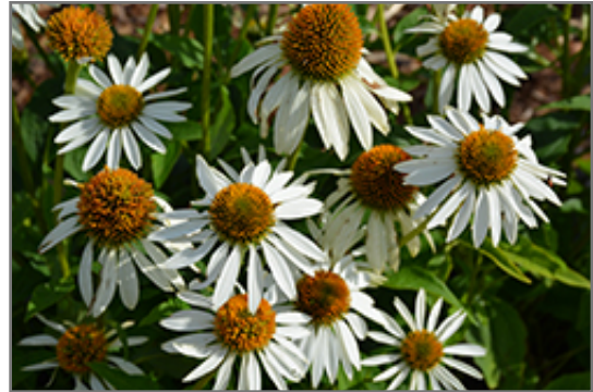
Happy Star Coneflower flowers

This is a relatively low maintenance plant, and is best cleaned up in early spring before it resumes active growth for the season. It is a good choice for attracting butterflies to your yard, but is not particularly attractive to deer who tend to leave it alone in favor of tastier treats. It has no significant negative characteristics.