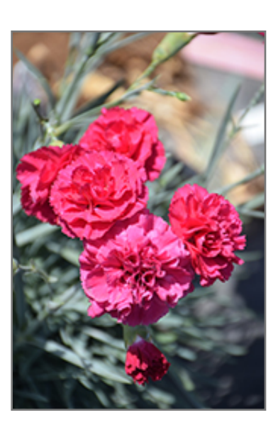
Devon Cottage Waterloo Sunset Pinks flowers

Large, double, bright red blooms on strong stems, above mounds of fine silver-blue foliage; great for flower arrangements; deadhead to rebloom; pair up with summer blooming perennials and annuals to time a continued flower display