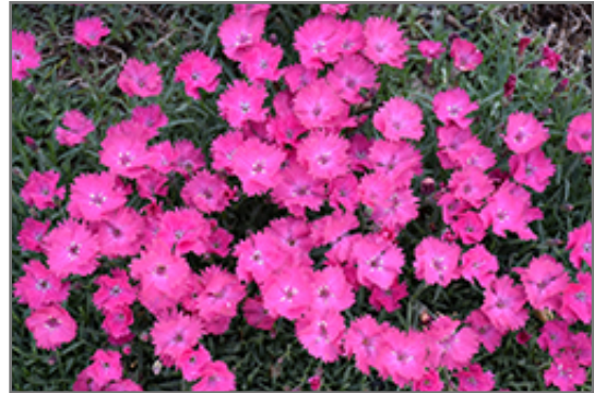
Vivid Bright Light Pinks flowers

Vivid Bright Light Pinks is recommended for the following landscape applications;