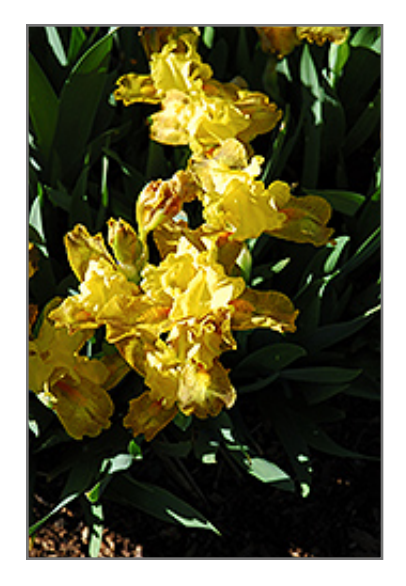
Chum Yellow Iris flowers

Chum Yellow Iris has masses of beautiful yellow flag-like flowers with harvest gold edges at the ends of the stems in late spring, which are most effective when planted in groupings. The flowers are excellent for cutting. Its sword-like leaves remain green in colour throughout the season.