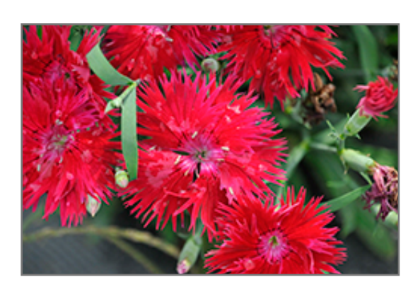
Supra Crimson Pinks flowers

Lovely frilly flowers are deep crimson red, above bushy, light green foliage; great for flower arrangements; deadhead to rebloom; pair up with summer blooming perennials and annuals to time a continued flower display