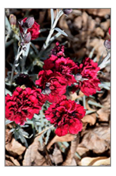
Odessa Red Pinks flowers

Impressive, frilly double flowers are deep crimson red with lighter red edges, above mounds of fine foliage; great for flower arrangements; deadhead to rebloom; pair up with summer blooming perennials and annuals to time a continued flower display