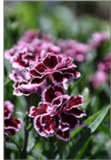
Odessa Pierrot Pinks flowers

Odessa Pierrot Pinks is recommended for the following landscape applications;