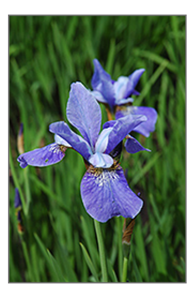
China Blue Siberian Iris flowers

China Blue Siberian Iris has masses of beautiful blue flag-like flowers with white overtones, burgundy throats and blue falls at the ends of the stems in mid spring, which are most effective when planted in groupings. The flowers are excellent for cutting. Its sword-like leaves remain green in colour throughout the season.