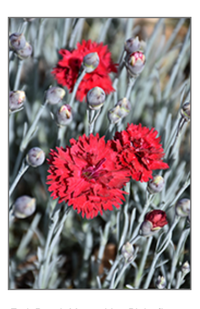
Fruit Punch Maraschino Pinks flowers

Stunning, fragrant double flowers are bright cherry red with burgundy eyes, above mounds of fine foliage; great for flower arrangements; deadhead to rebloom; pair up with summer blooming perennials and annuals to time a continued flower display