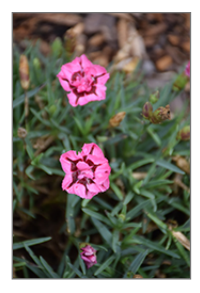
EverLast Red plus Pink Pinks flowers

EverLast Red plus Pink Pinks is recommended for the following landscape applications;