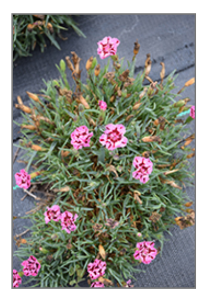
EverLast Red plus Pink Pinks in bloom