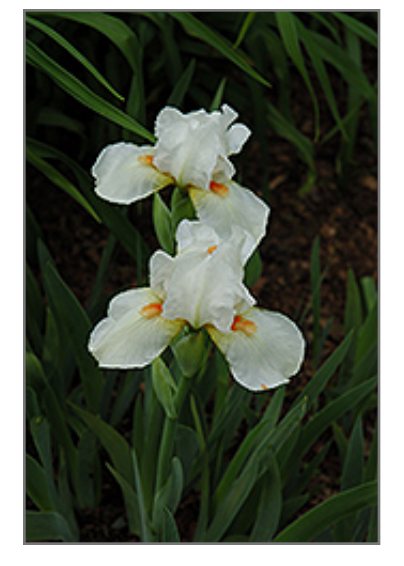
Cheers Iris flowers

Cheers Iris has masses of beautiful white flag-like flowers with a orange beard at the ends of the stems in mid spring, which are most effective when planted in groupings. The flowers are excellent for cutting. Its sword-like leaves remain green in colour throughout the season.