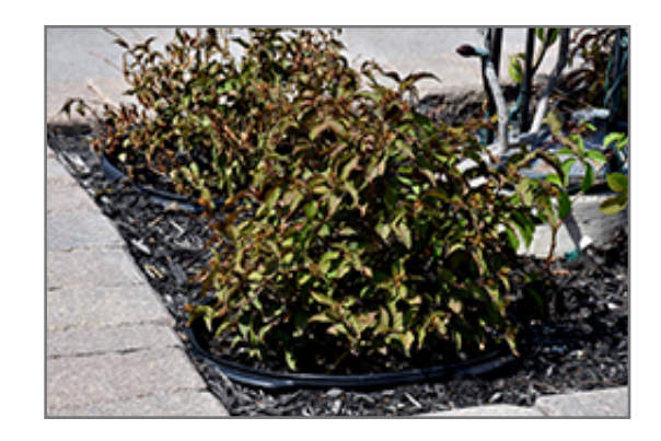
Nightglow Diervilla