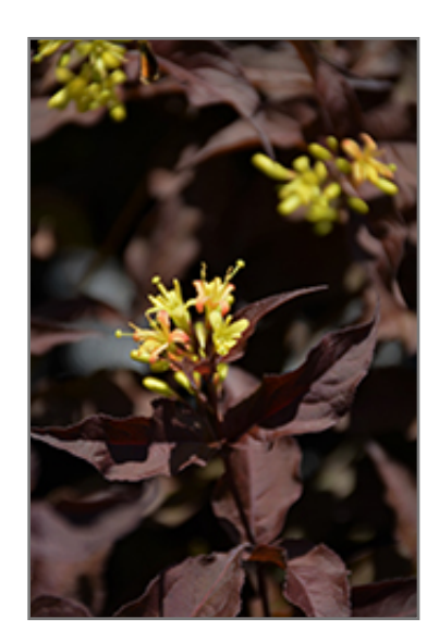
Nightglow Diervilla flowers

Nightglow Diervilla is a dense multi-stemmed deciduous shrub with a mounded form. Its average texture blends into the landscape, but can be balanced by one or two finer or coarser trees or shrubs for an effective composition.