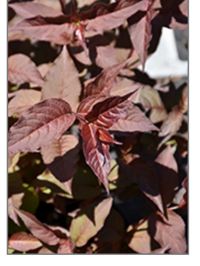
Nightglow Diervilla foliage