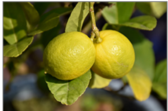
Key Lime fruit