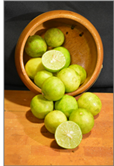
Key Lime fruit and flesh

-- THIS IS A HOUSEPLANT AND IS NOT MEANT TO SURVIVE THE WINTER OUTDOORS IN OUR CLIMATE --