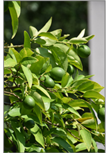
Key Lime fruit

This is a multi-stemmed evergreen houseplant with an upright spreading habit of growth. This plant may benefit from an occasional pruning to look its best.