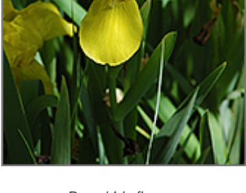
Brassi Iris flowers

Brassi Iris has masses of beautiful yellow flag-like flowers with yellow falls at the ends of the stems in late spring, which are most effective when planted in groupings. The flowers are excellent for cutting. Its sword-like leaves remain green in colour throughout the season.