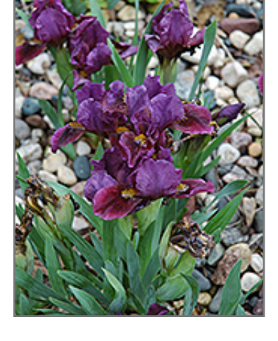
Blue Capers Iris flowers

Blue Capers Iris features bold royal blue flag-like flowers with yellow throats and burgundy falls at the ends of the stems in late spring. The flowers are excellent for cutting. Its sword-like leaves remain green in colour throughout the season.