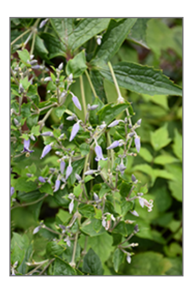
Japanese Clematis flowers

This is a relatively low maintenance plant. It is a Type 3 clematis; each spring it should be pruned back to within a few inches of the ground, as it flowers on new wood of the season. It is a good choice for attracting hummingbirds to your yard. It has no significant negative characteristics.