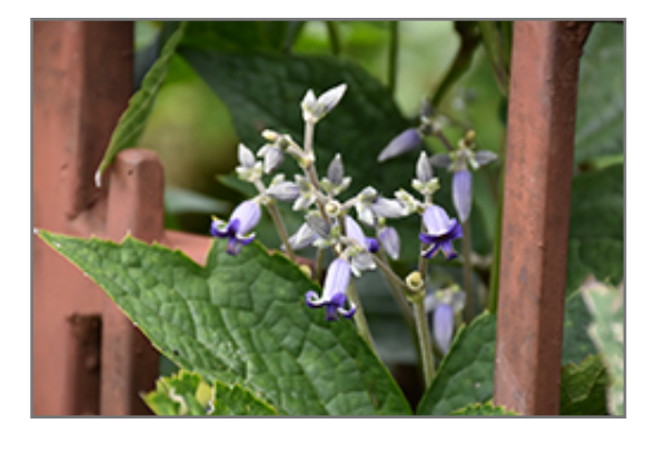
Japanese Clematis flowers

Japanese Clematis is an herbaceous perennial with an upright spreading habit of growth. Its medium texture blends into the garden, but can always be balanced by a couple of finer or coarser plants for an effective composition.