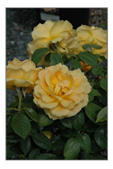
Easy Going Rose (tree form) flowers

Easy Going Rose (tree form) is ideal for use as a garden accent or patio feature, and is recommended for the following landscape applications;