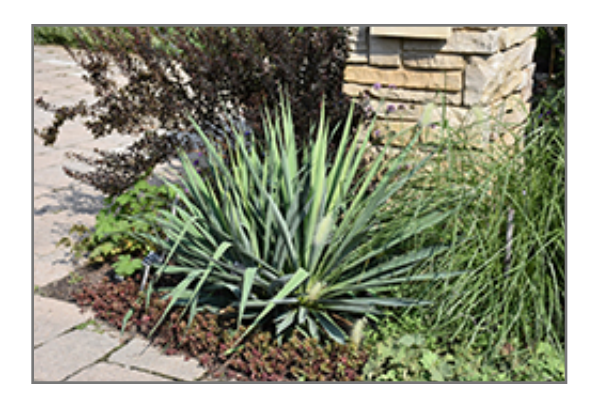
Ivory Tower Adam's Needle

Ivory Tower Adam's Needle is recommended for the following landscape applications;