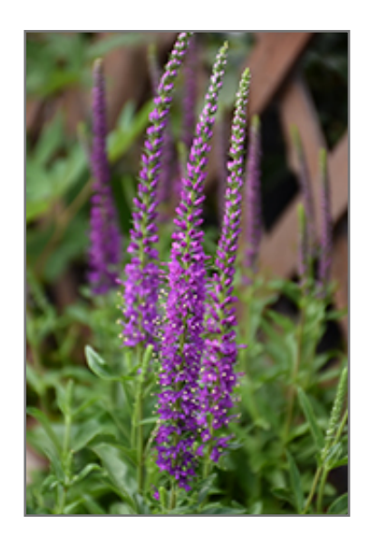
Mona Lisa Smile Speedwell flowers