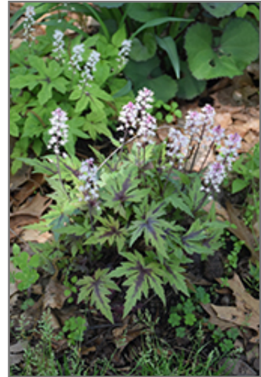
Cutting Edge Foamflower in bloom

This is a relatively low maintenance plant, and is best cleaned up in early spring before it resumes active growth for the season. Deer don't particularly care for this plant and will usually leave it alone in favor of tastier treats. It has no significant negative characteristics.