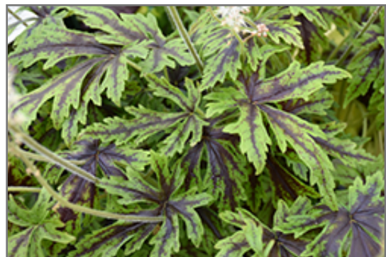
Cutting Edge Foamflower foliage