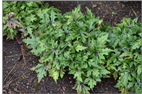
Cutting Edge Foamflower

Cutting Edge Foamflower is a fine choice for the garden, but it is also a good selection for planting in outdoor pots and containers. It is often used as a 'filler' in the 'spiller-thriller-filler' container combination, providing a mass of flowers and foliage against which the larger thriller plants stand out. Note that when growing plants in outdoor containers and baskets, they may require more frequent waterings than they would in the yard or garden. Be aware that in our climate, most plants cannot be expected to survive the winter if left in containers outdoors, and this plant is no exception. Contact our experts for more information on how to protect it over the winter months.