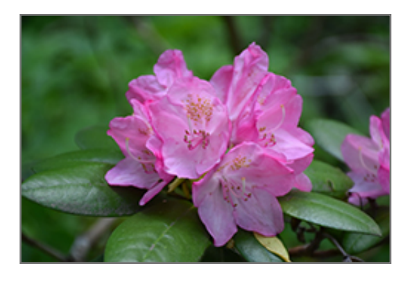
Polaris Rhododendron flowers