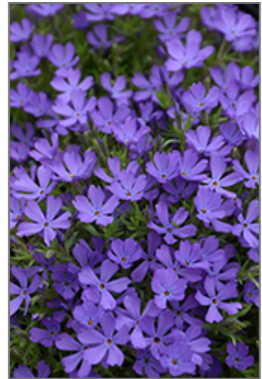
Violet Pinwheels Phlox flowers

Violet Pinwheels Phlox is recommended for the following landscape applications;