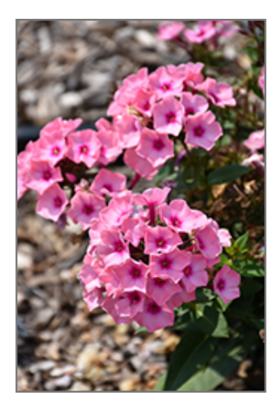
Famous Pink Dark Eye Garden Phlox flowers

Beautiful rose pink flowers with hot pink eyes, that bloom prolifically from late spring into summer; compact, well branched plants suitable for containers or small perennial borders; good mildew resistance