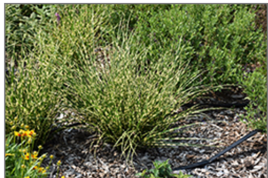
Bandwidth Maiden Grass