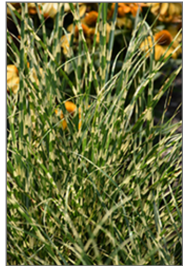
Bandwidth Maiden Grass foliage

Bandwidth Maiden Grass is recommended for the following landscape applications;