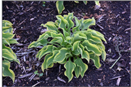
Wrinkle in Time Hosta