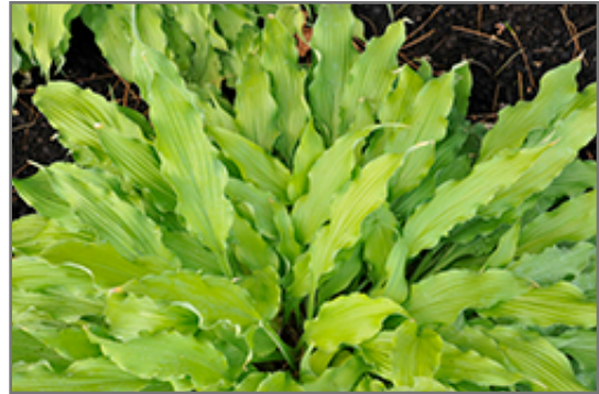
Wiggles and Squiggles Hosta foliage

Wiggles and Squiggles Hosta is recommended for the following landscape applications;