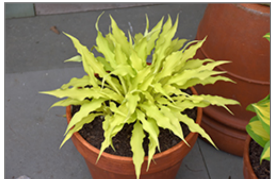
Wiggles and Squiggles Hosta