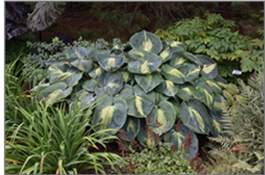
Rhino Hide Hosta