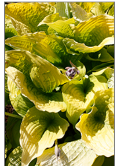
Shadowland Coast to Coast Hosta foliage