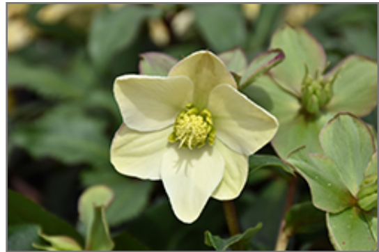
HGC Winter's Song Hellebore flowers

HGC Winter's Song Hellebore is recommended for the following landscape applications;