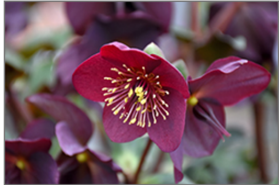
HGC Ice N' Roses Red Hellebore flowers

HGC Ice N' Roses Red Hellebore is recommended for the following landscape applications;