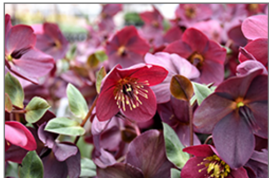
HGC Ice N' Roses Red Hellebore flowers