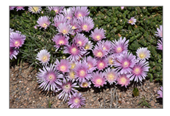
Lavender Ice Ice Plant flowers